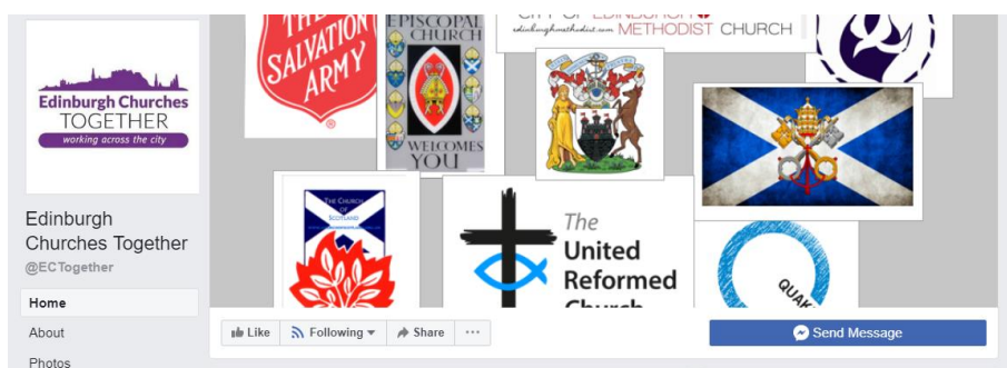
Edinburgh Churches Together Facebook Profile page

Our social media profile has been significantly increased: our Facebook page now has 174 followers, an increase of about 20% 6 months. Our Twitter followers