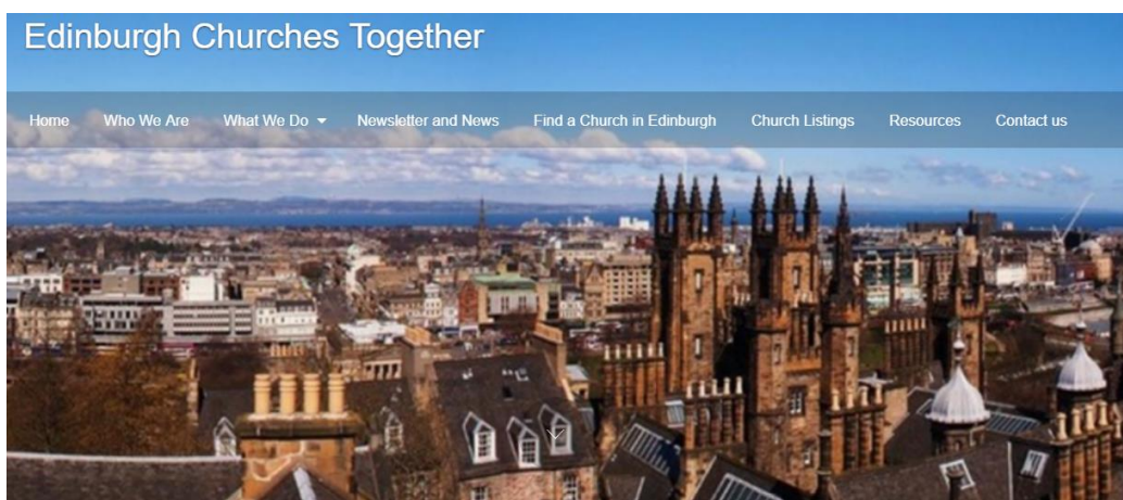
Website Home Page