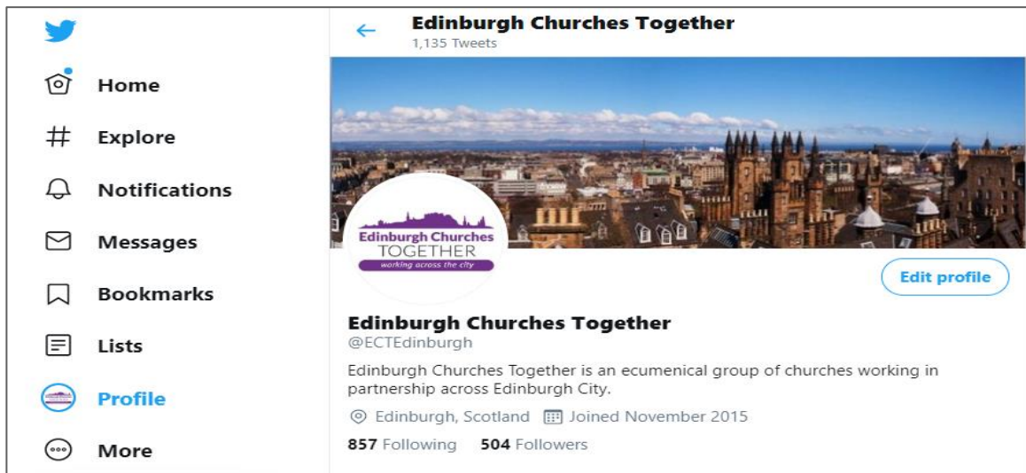
ECT Twitter Profile page

Newsletter In 2019, a decision was taken to publish the ECT e-newsletter four times a year instead of six. This allows the newsletter to focus on ‘seasonal’ events both for the Christian calendar and for the city of Edinburgh. The newsletter will now be published in June (Summer), September (Autumn), December (Winter) and March (Spring). As our social media reflects many one-off events, the newsletter is ideal for slightly longer articles. A special feature is a regular slot to publicise workplace chaplaincy across the city. This year saw articles written by chaplains in the theatre workplace, Edinburgh Airport and most recently the Australian chaplains working in the state of Victoria amongst victims of the bush fires. The newsletter is circulated by email to an ever-expanding