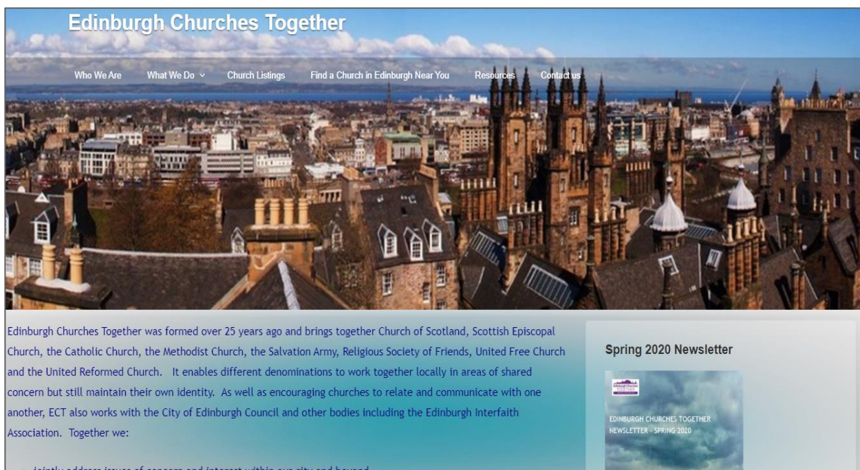
ECT Website Homepage

Churches information document and heritage building maintenance. There is now a sidebar on the home page with a link to the most recent newsletter and information about upcoming ECT-specific events e.g. service for Week of Prayer for Christian Unity.