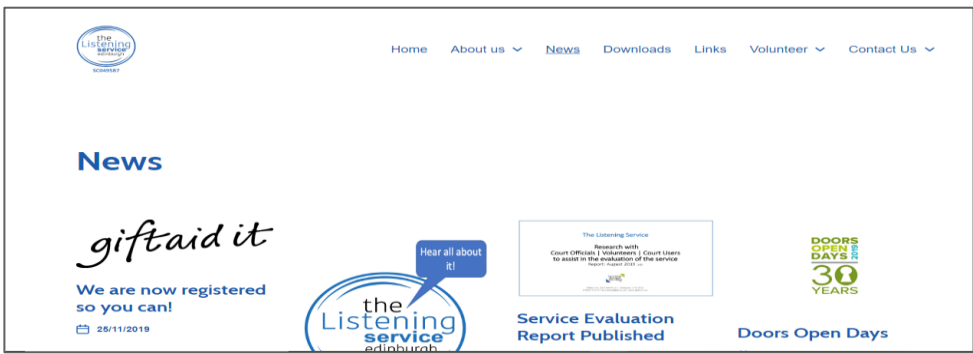
Listening Service Website page