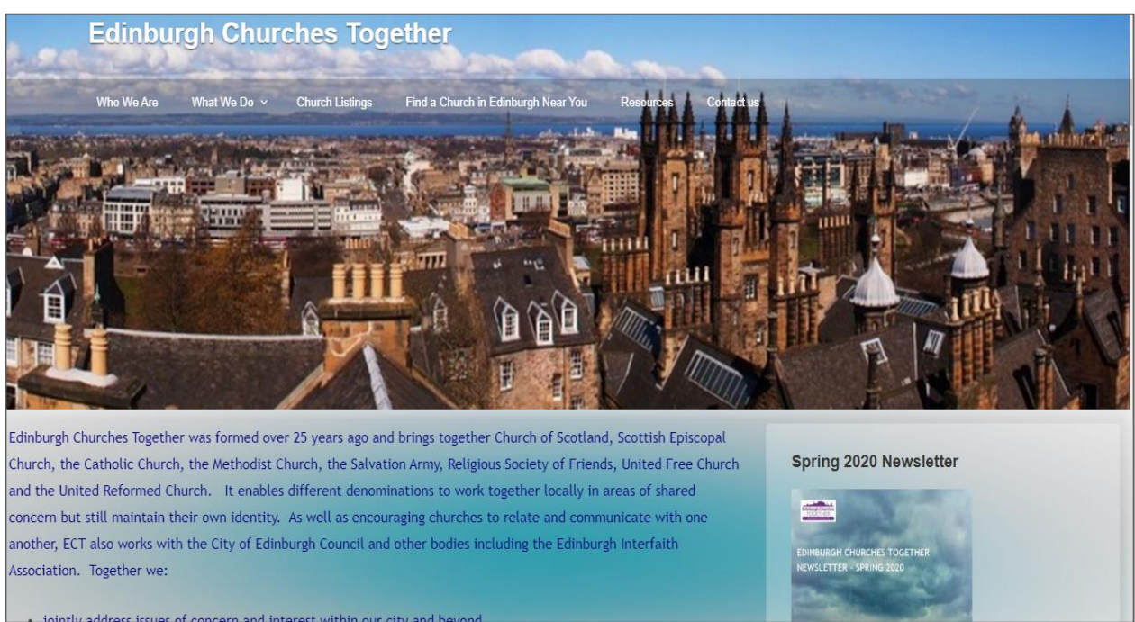
ECT Website Homepage

Churches information document and heritage building maintenance. There is now a sidebar on the home page with a link to the most recent newsletter and information about upcoming ECT-specific events e.g. service for Week of Prayer for Christian Unity.