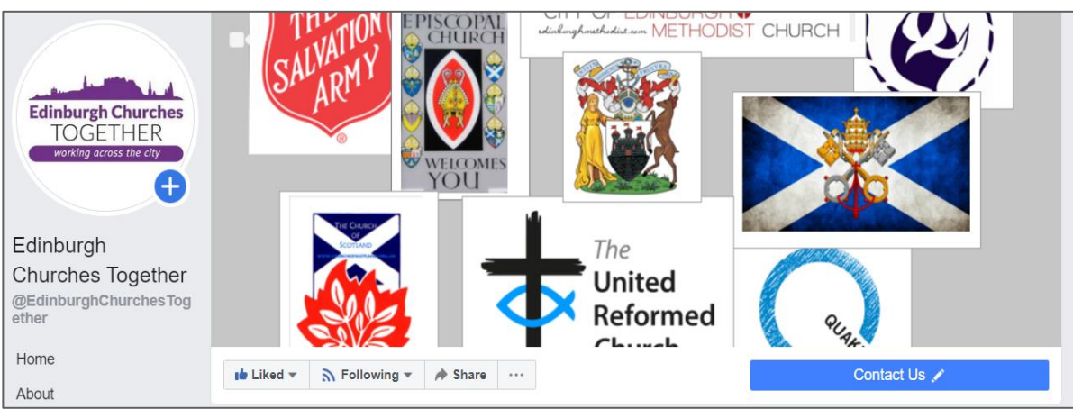
ECT Facebook Page

Social Media Our social media profile has increased significantly over 2019: our Facebook page, @EdinburghChurchesTogether, now has 231 followers – an increase of almost 40% from 2018. Our Twitter followers have increased by over 50% to 501. Our Twitter feed, @ECTEdinburgh, is prominently displayed on the home page of the website.